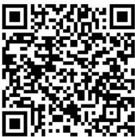
Ranch Wish List

We couldn't run the Ranch without your support, and we are so grateful!